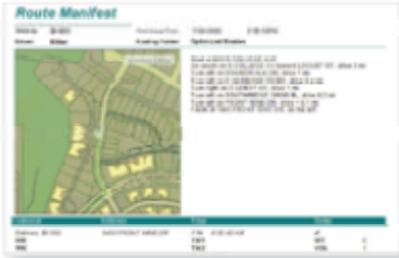
Create dispatcher summary reports, route overview maps, street-level directions, route manifests, and more.